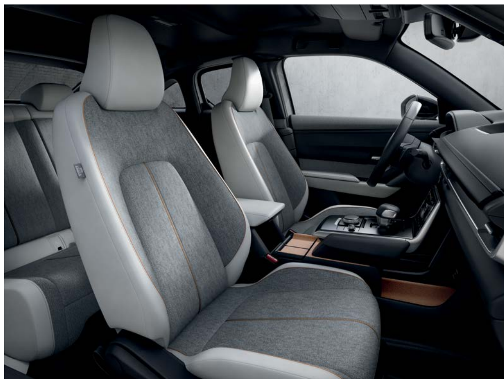
Above: Modern Confidence 1 interior colour scheme: Light grey fabric with Pure White Leatherette 1