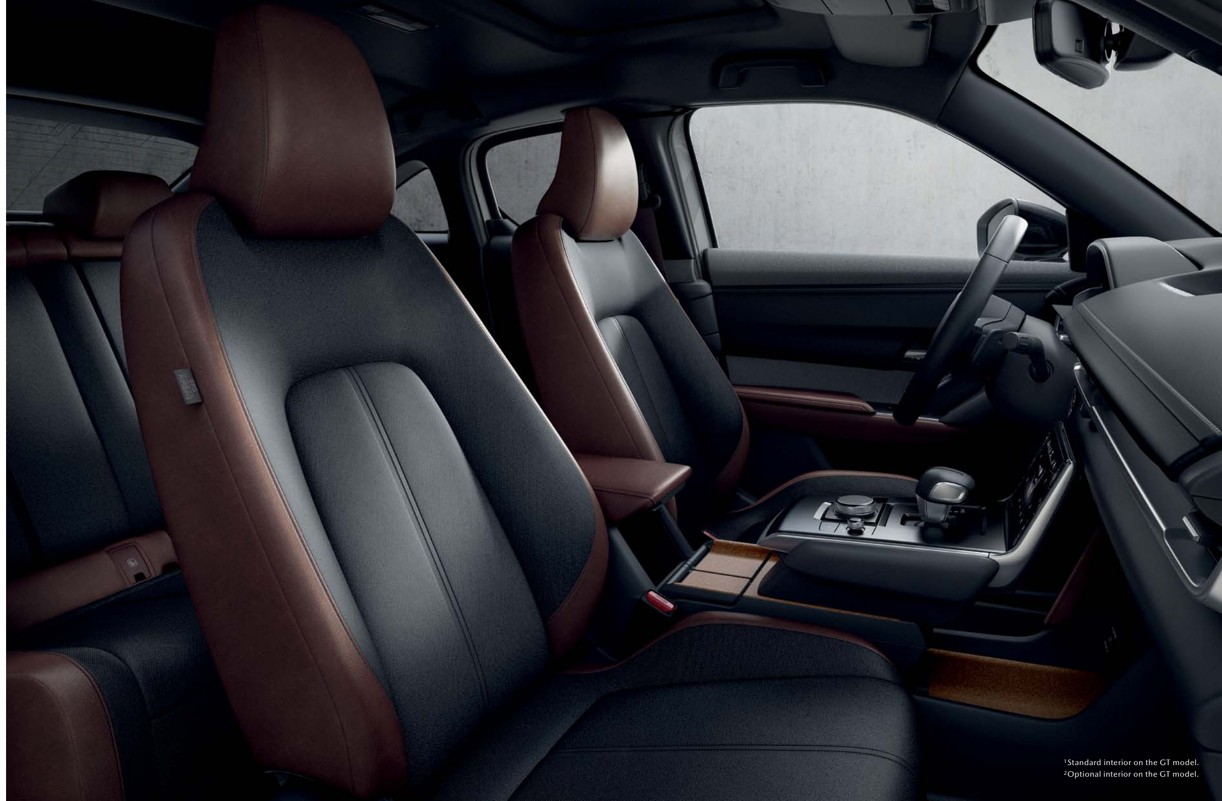
Right: Vintage Industrial 2 interior colour scheme: Dark grey fabric with Vintage Brown Leatherette